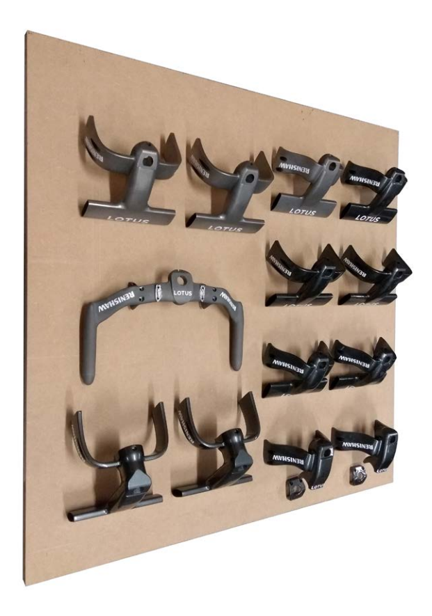
3D printed titanium and aluminium handlebar components